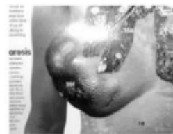
SMOKING CAUSES BREAST CANCER