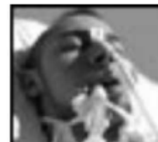
TOBACCO SMOKING KILLS