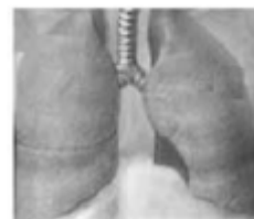
KEEP YOUR LUNGS HEALTHY STOP SMOKING