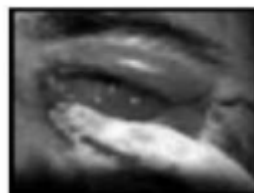
SMOKING CAUSES CATARACTS AND BLINDNESS