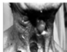
SMOKING CAUSES THROAT CANCER