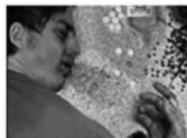
SMOKING IS DANGEROUS TO YOUR HEALTH