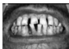
SMOKING SPOILS YOUR TEETH