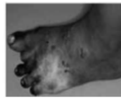
TOBACCO SMOKING CAUSES DISEASES