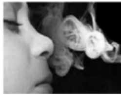
SMOKING IS DANGEROUS TO YOU AND NON- SMOKERS