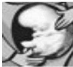
SMOKING IS DANGEROUS TO THE UNBORN BABY